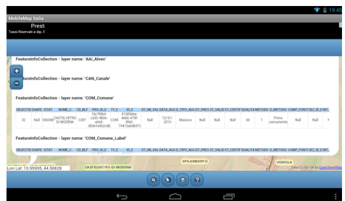
Fig. 3 – Querying layers in MobileMap Italy.

We also developed a web app that allows consultation of published services by browser, which supports viewing map data and geo-referenced queries on maps, by using open source libraries and scripting codes. The web app is