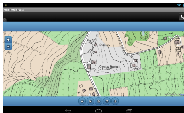
Fig. 1 – Main screen of MobileMap Italy.

We can distinguish two groups of mobileGIS applications (Müller et al., 2013): a first group consists of apps capable to show POI (points of interest) and able to offer geolocation, navigation and searching. Some examples are Google Maps, Bing Maps and iOS Maps. Another one consists of apps that allow users to add thematic data to maps. Some examples are ArcGIS for Windows Mobile (Guandalini, 2013), BeeGIS